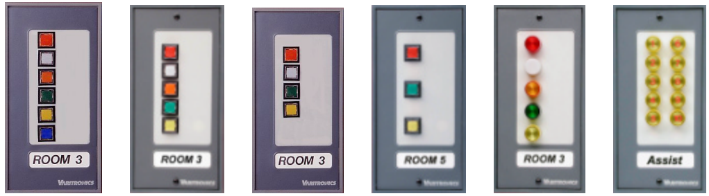
336SM 335SM 334SM 333SM 335L 3310L

A selection of our many components are pictured below.