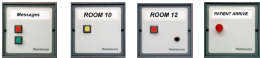
552SM 551SM 551SM-TB 551L